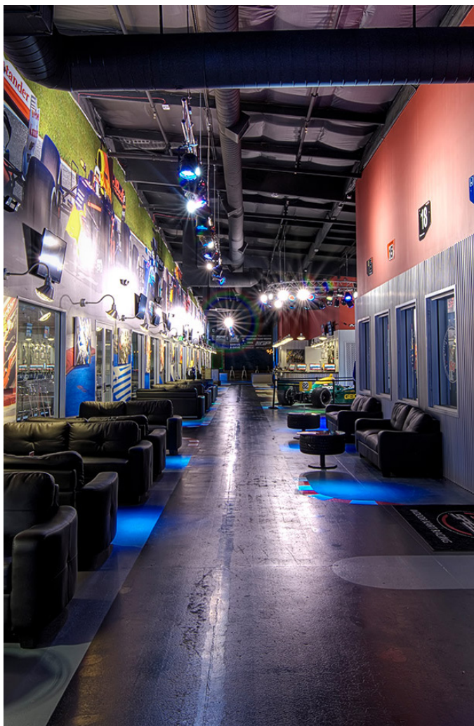
Technical Builders does ground-up construction for specialty businesses from retail to office buildings and healthcare to hightech manufacturing.