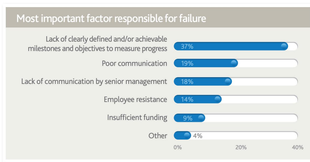
Figure 7: Factors for Strategic Initiative Failure

With a process-oriented culture in place, let's focus on visibility as our next building block. Project management is, by nature, a reactionary business. Plans change, services are added or removed, resources are reallocated. The consequences mean that your PM is constantly putting out fires – and although the focus is on future deliverables this isn't necessarily true for the financial side. As an example, PMs may only be reviewing invoices as they are issued, without greater insight into the project's financial status. Visibility into status for your PM is one of the most crucial aspects to project management. Knowing where projects stand, milestones, availability of resources, and associated metrics should all be quickly accessible to the PM to help them make informed decisions. A recent study by PMI 2 shows that among the causes of project failure, 37% cited a lack of visibility into project milestones as the leading cause. To remedy this, ensure your PM has access to readily available dashboards that include the full portfolio of projects and their associated KPI. Items such as budget to actual costs, profit, and resource utilization should be easy for your PM to track and measure. Lacking these metrics makes it difficult for your PM to plan efficiently and makes it even more difficult to take a strategic approach to project management.